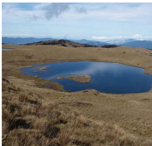
Mt. Albert-Edward glacial lake in subalpine grassland.

In the next 5 years, the Kokoda Initiative will continue to investigate the natural, cultural and historic values as well as sustainable economic opportunities in this broader area.