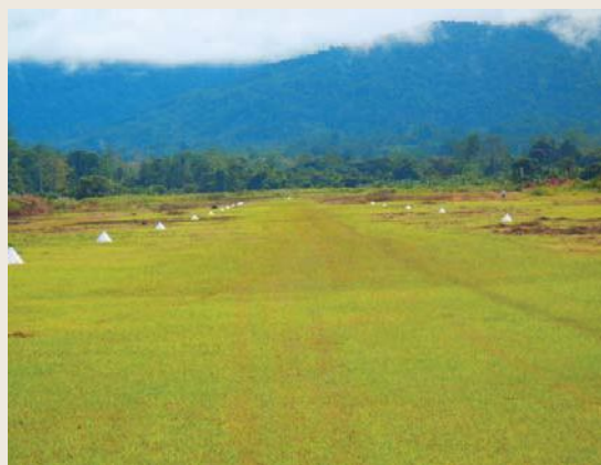
The freshly cut Kokoda airstrip.

KTA, through the Kokoda Initiative Safety Package, will be delivering a tractor and slasher in the coming months to assist with continued maintenance of the airstrip. Preparation for a new terminal at Kokoda is underway, with steel framing and bush material used as building material.