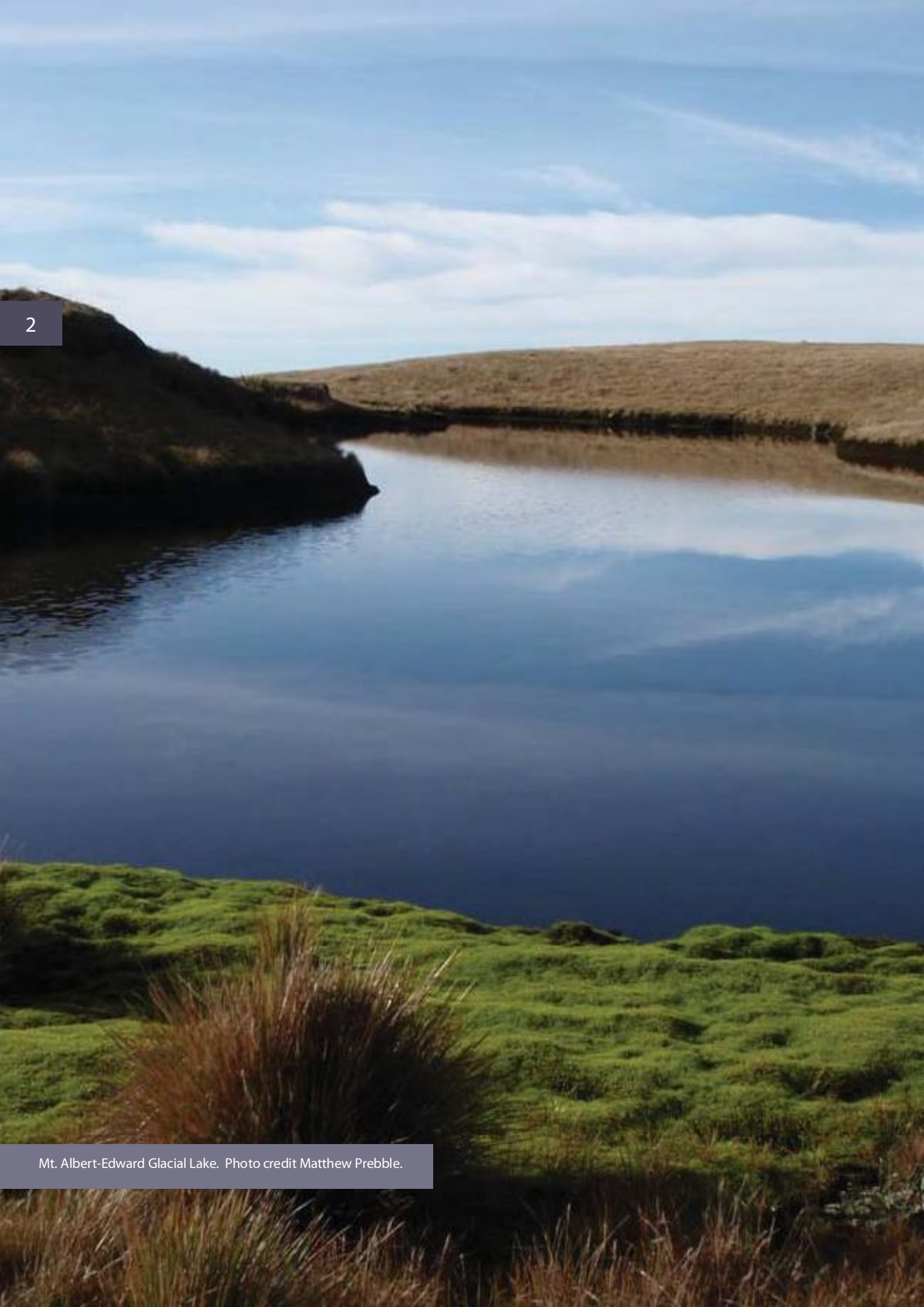
Mt. Albert-Edward Glacial Lake.