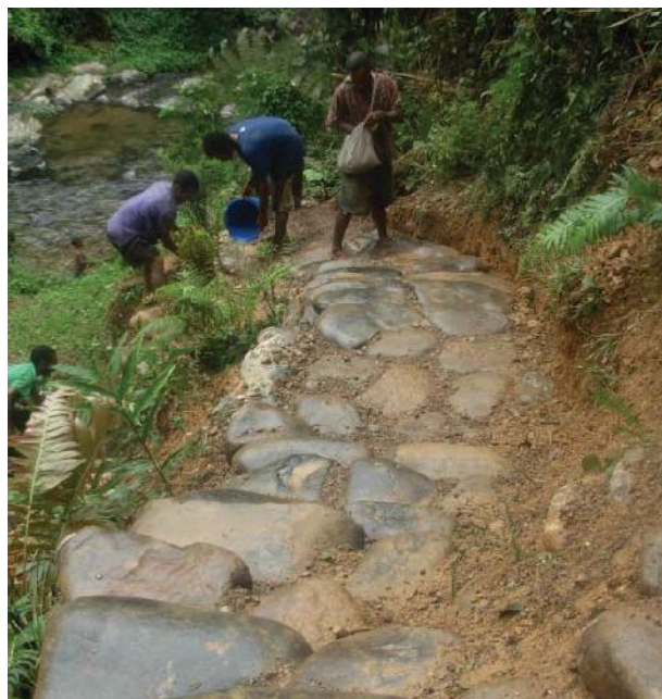
Track conservation and maintenance undertaken by community workers around loribaiwa ridge.