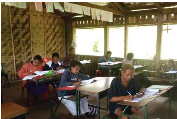
Participants of the Business Training Workshop at Efogi.

The KTA will continue to support communities in the Kokoda Track corridor in starting businesses. A community mentor program will ensure that community businesses will be supported at the start and as their business grows. Fifteen community mentors along the Kokoda Track have been selected from mentor training, which will build their skills in coaching and business development.